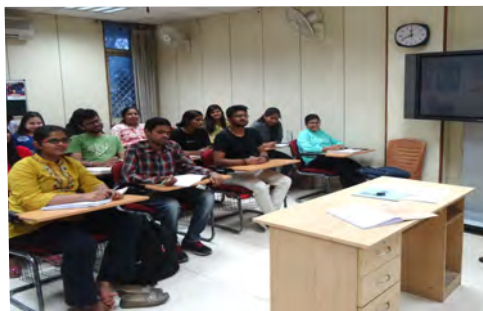
M. Phil. - Ph.D. Candidates taking Examination

These programmes are designed to build the research capacity of scholars from varied backgrounds and provide a strong knowledge and skill base in related areas of educational policy, planning, administration and finance. The research studies completed under the M. Phil. and Ph. D. programmes are expected to make significant contributions in enriching the knowledge base, besides providing critical inputs for policy formulation, implementation of reform programmes and capacity building activities. The broad areas of research, covering school and/or higher education are as under: