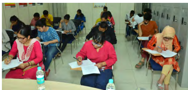
M. Phil. and Ph.D. Scholars

The scholars registered for Ph. D. Programme will work on an approved topic and submit the thesis under an identified supervisor. After satisfactory evaluation, successful scholars shall be awarded Ph. D. degree.